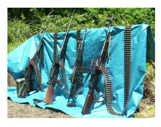
Armaments confiscated on October 2, 1999. Mina Sector. Saniveni River. San Martín de Pangoa. An MI-17 helicopter No. 633 was ambushed.

Combatants of the People's Liberation Army. Communist Party of Peru, Marxist-Leninist-Maoist, Gonzalo Thought. Pampa Aurora September 2013. North of the Huanta Province, zone of the warrior Vizcatán.