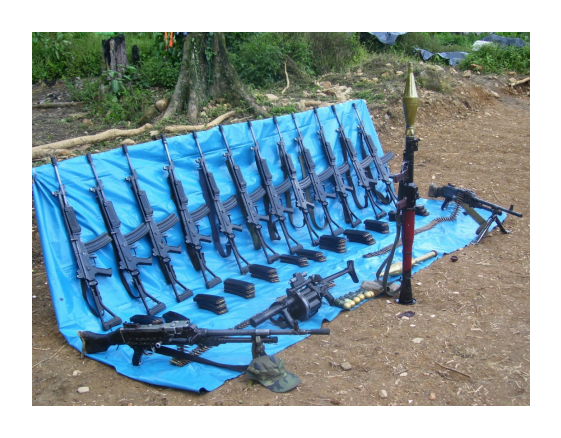
Ambush in Ccompipata. Sanahamba. Huanta. Ayacucho. April 9, 2009.