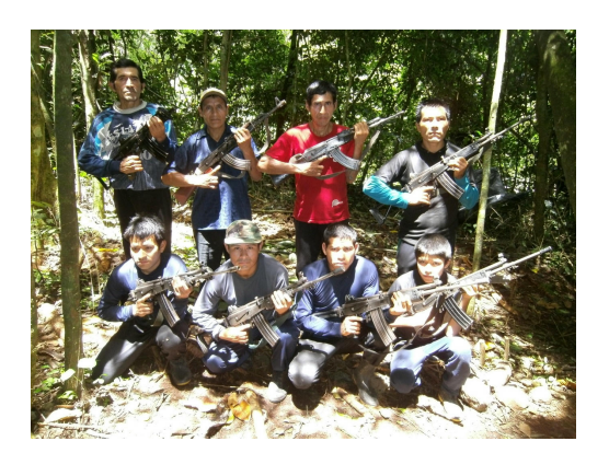
Combatants of the People's Liberation Army in the sector called Churrubamba, Huanta Province— Ayacucho. February 2012.

In war, the side who asks for dialogue is the defeated side. This defeated side has a double intention: 1. to regain strength by means of truce, take a breather, and then launch a furious counterattack; the other feels lost and wants to preserve part of his interests at the negotiating table to conserve part of his strength and attack again at a later date. This is also the way restorations take place.