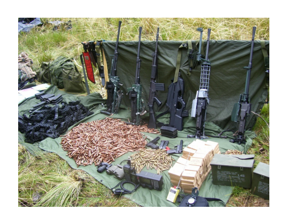
Demolition and ambush in Sinaycocha. September 2, 2009. Santo Domingo de Acobamba. Junín. MI-17 Helicopter, FAP<sup>15</sup> No. 640.

So, what happened to the so-called defeat of the Shining Path, the defeat of terrorism, the peace agreement, national pacification and so many other tirades? We firmly believe that all this is an infamy against the Party. With revolutionary fervor we unfurl to the wind the red flags of rebellion. Long live the People's War! It is right to rebel! Storm the heavens! Our invincible weapon: Marxism-Leninism-Maoism, Gonzalo Thought. The reactionaries say: Surrender your weapons. We reply: Come and take