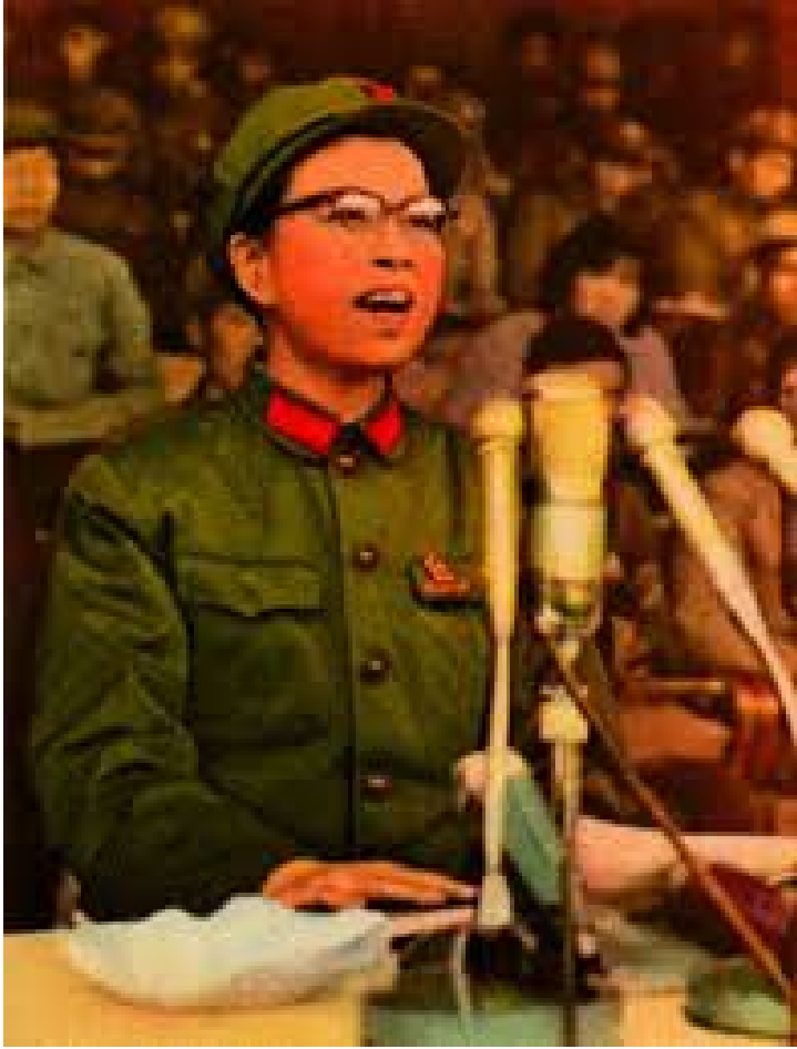
COMRADE JIANG QING, STANDARD OF THE GREAT PROLETARIAN CULTURAL REVOLUTION. COMPANION, COMRADE AND FAITHFUL DISCIPLE OF CHAIRMAN MAO ZEDONG.