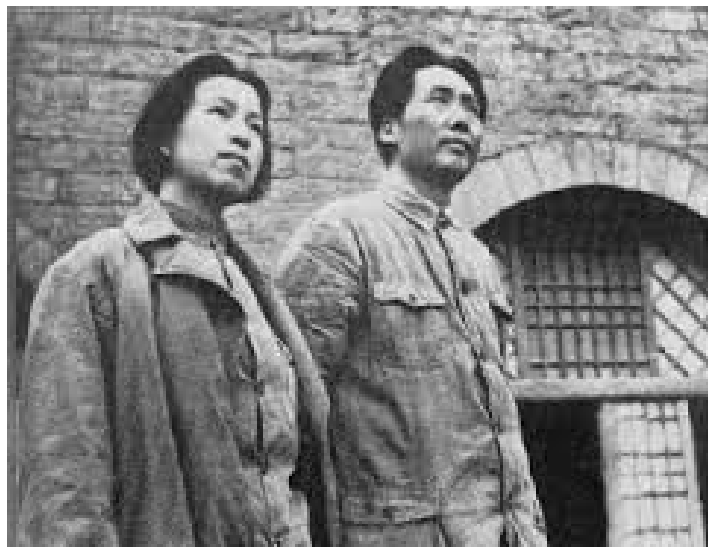
Chairman Mao Zedong and Comrade Jiang Qing, at the Yen-an support base.