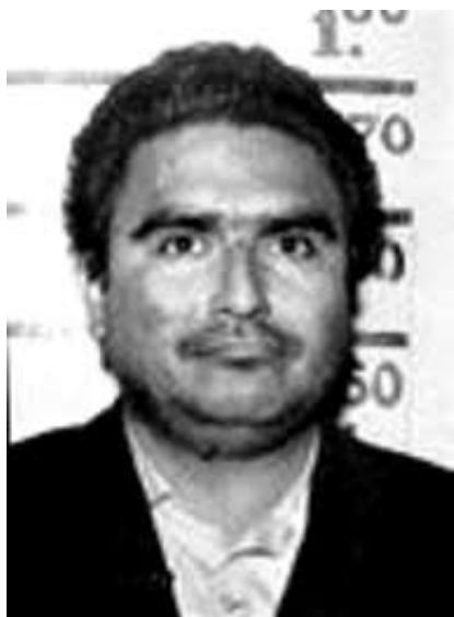
Dr. Abimael Guzmán Reinoso, Chairman Gonzalo. Head of the Communist Party of Peru, Great Marxist-Leninist-Maoist,

OF EVERY REVOLUTION IS THE TAKING OF POWER THROUGH ARMED STRUGGLE, THAT IS, THE SOLUTION OF THE PROBLEM THROUGH WAR. THIS REVOLUTIONARY MARXIST-LENINIST-MAOIST PRINCIPLE, GONZALO THOUGHT, HAS UNIVERSAL VALIDITY, BOTH IN PERU AS IN OTHER COUNTRIES". -Central Committee of the PCP.