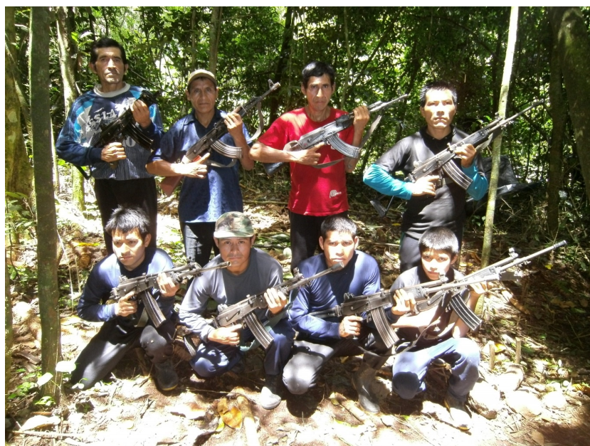
Combatants of the Popular Liberation Army, in the sector

In a war, the loser is the one who asks for a dialogue. With double intentions: one, through a truce, to regain strength, find a respite and then launch a furious counterattack; another feels lost and what he wants is to preserve part of his interests at a negotiating table, to conserve part of his strength and at a later time to attack again. Thus, too, restorations occur.