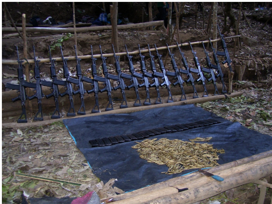
Ambush at Tintay Puncu. Tayacaja. Huancavelica. 09 October 2008.