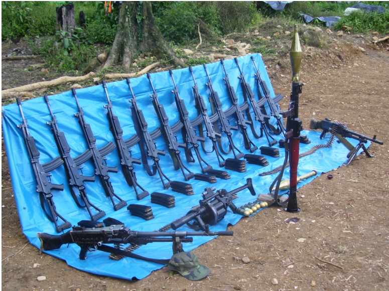
Ambush in Ccompipata. Sanabamba. Huanta. Ayacucho. April 9, 2009.