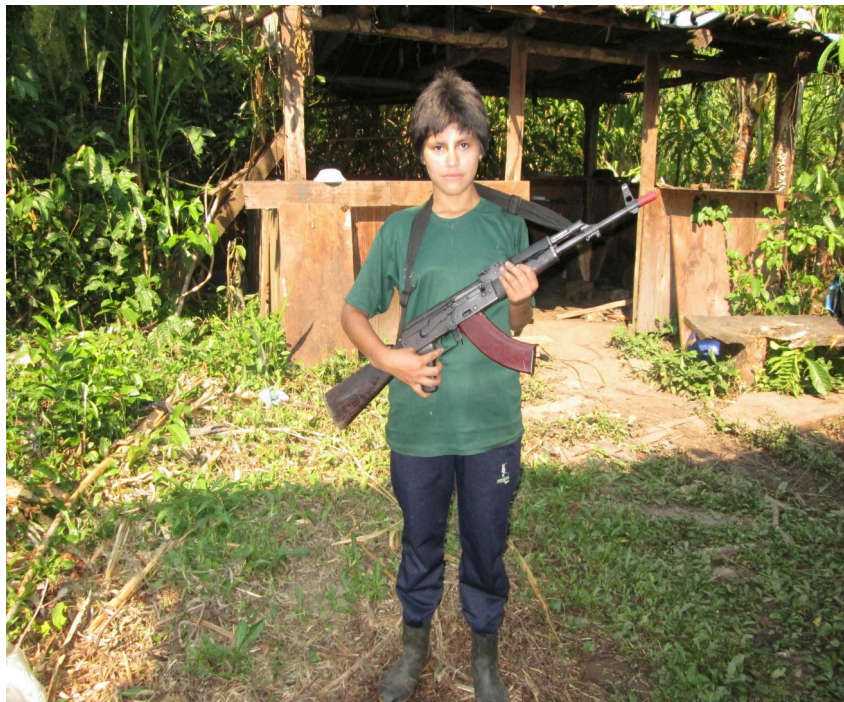
Photo of a combatant