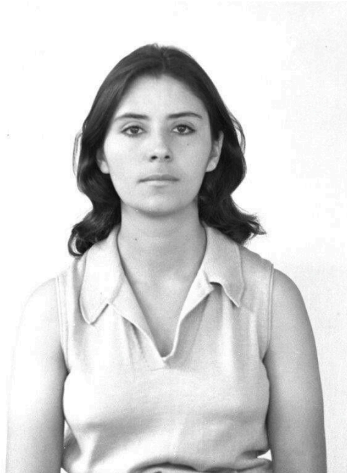
Augusta La Torre Carrasco, Comrade Norah, communist combatant, companion and comrade of Chairman Gonzalo. Honor and Glory!