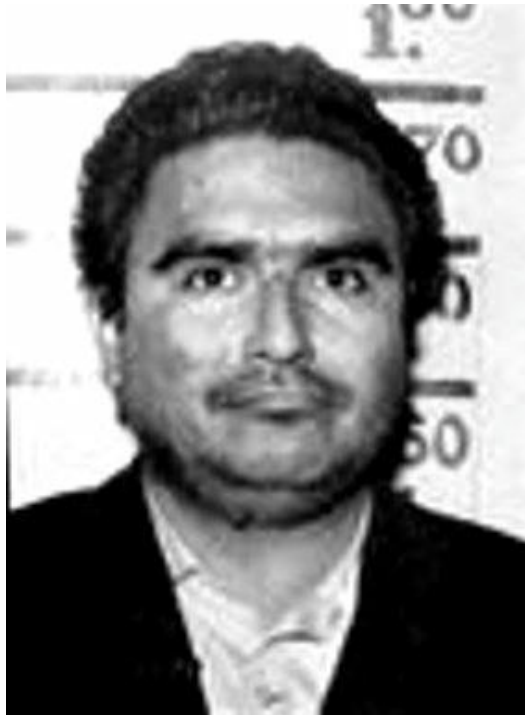
Dr. Abimael Guzmán Reinoso, Leader of the Communist Party of Peru, Great Follower of Marxism-Leninism-Maoism, Gonzalo Thought.

— Central Committee of the Communist Party of Peru