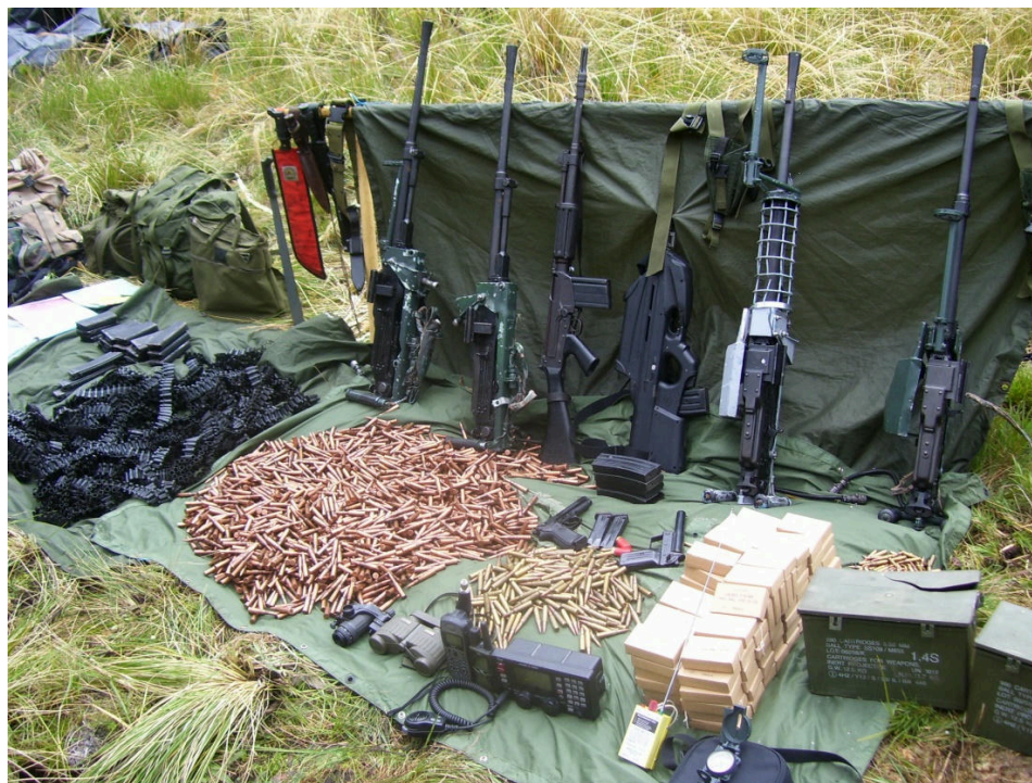
Demolition and ambush in Sinaycocha. September 2, 2009. Santo Domingo de Acobamba. Junín.