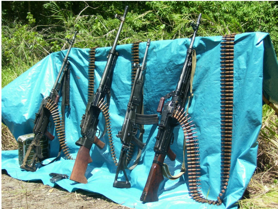
Armaments confiscated on October 2, 1999. Mina Sector. Saniveni River. San Martín de Pangoa. An MI-17 helicopter No. 633 was ambushed.