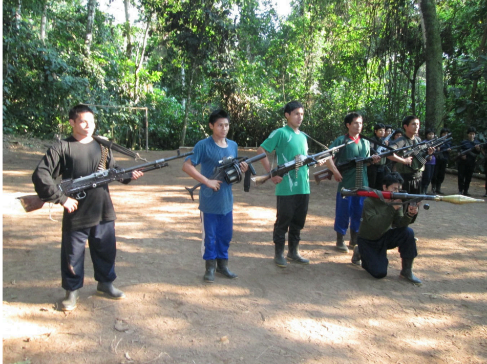
Combatants of the People's Liberation Army. Communist Party of Peru, Marxist-Leninist-Maoist, Gonzalo Thought. Pampa Aurora September 2013. North of the Huanta Province, zone of the warrior Vizcatán.