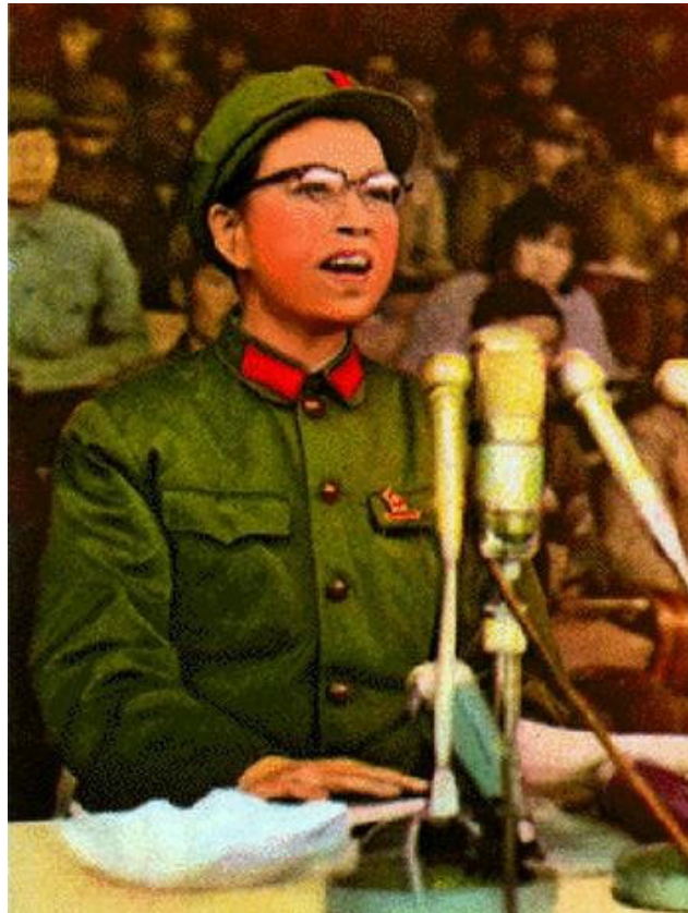
Comrade Jiang Qing, flag-bearer of the Great Proletarian Cultural Revolution, companion, comrade, and loyal disciple of Chairman Mao Zedong.

this tug of war, they decided to publish it, choosing to blame the Party for the deaths and exonerating the armed and police forces of the genocide against the Peruvian people. Subsequently, this same Commission throws to the wind the tale of national reconciliation to which the opportunists and rotten revisionists of MOVAREF join in. Thus, this so-called Truth Commission smacks of the reactionary state of Peru and Yankee imperialism. This bastard organization, an instrument of U.S. imperialism and the reactionary government of Peru, claimed to be an organization that preaches the truth, with the greatest cynicism and impudence, has worked for the reactionary government of Peru to safeguard the interests of the exploiters at the detriment of the Peruvian people.