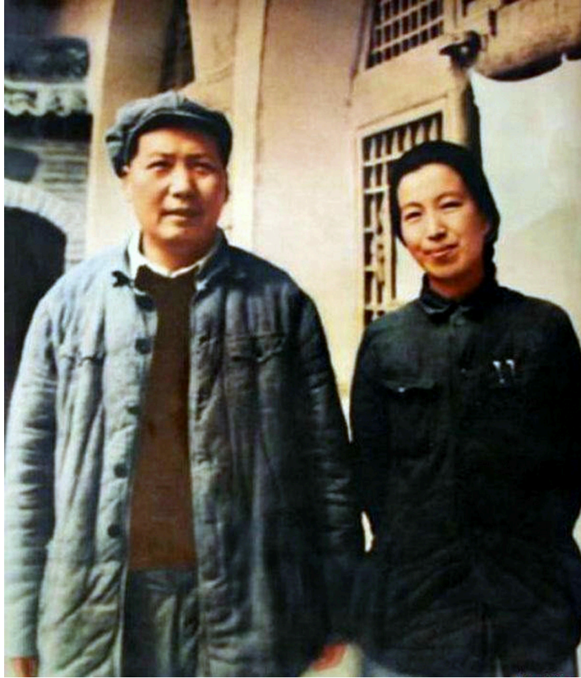
Picture taken at the Yan'an Base Area. Chairman Mao Zedong and Comrade Jiang Qing. Flag-bearers of the Great Proletarian Cultural Revolution. Maoism, the Third, New, and Higher stage of the ideology of the proletariat.