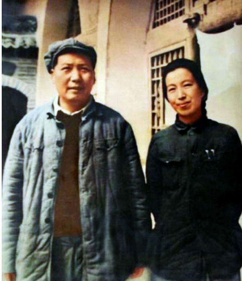
Picture taken at the Yan'an Base Area. Chairman Mao Zedong and Comrade Jiang Qing. Flag-bearers of the Great Proletarian Cultural Revolution. Maoism, the Third, New, and Superior stage of the ideology of the proletariat.