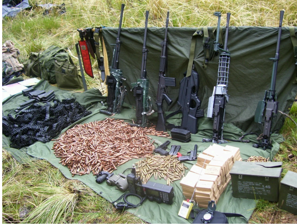
Demolition and ambush in Sinaycocha. September 2, 2009. Santo Domingo de Acobamba. Junín. MI-17 Helicopter, FAP 13 No. 640.

So, what happened to the so-called defeat of the Shining Path, the defeat of terrorism, the peace agreement, national pacification and so many other tirades? We firmly believe that all this is an infamy against the Party. With revolutionary fervor we unfurl to the wind the red flags of rebellion. Long live the People's War! It is right to rebel! Storm the heavens! Our invincible weapon: Marxism-Leninism-Maoism, Gonzalo Thought. The reactionaries say: Surrender your weapons . We reply: Come and take them . Once again we raise to the top the slogan of Chairman Mao: He who is not afraid of death by a thousand cuts dares to unhorse the emperor.