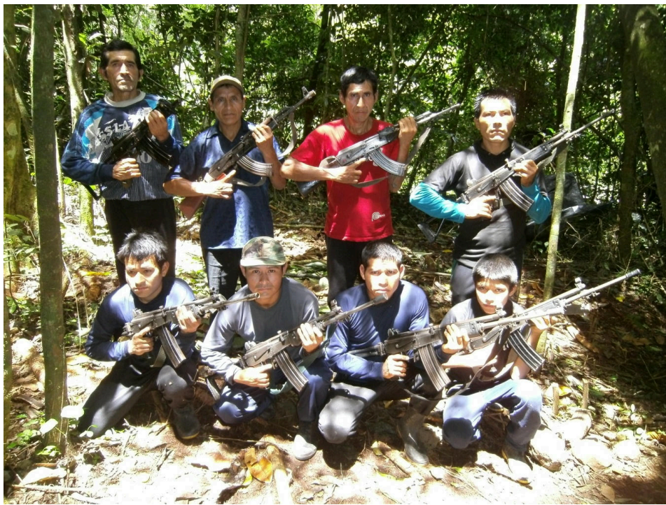
Combatants of the People's Liberation Army in the sector called Churrubamba, Huanta Province–Ayacucho. February 2012.

In war, the side who asks for dialogue is the defeated side. This defeated side has a double intention: 1. to regain strength by means of truce, take a breather, and then launch a furious counterattack; the other feels lost and wants to preserve part of his interests at the negotiating table to conserve part of his strength and attack again at a later date. This is also the way restorations take place.