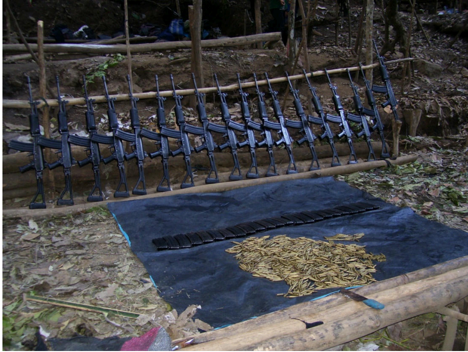
Ambush in Tintay Puncu. Tayacaja. Huancavelica. October 9, 2008.