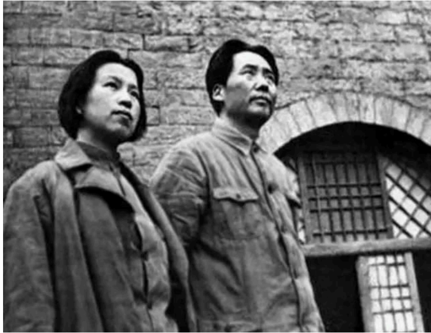
Chairman Mao Zedong and Comrade Jiang Qing, in the Yan'an base area.