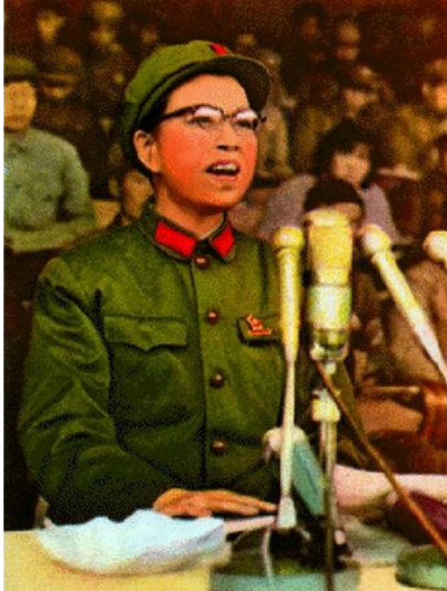
Comrade Jiang Qing, flag-bearer of the Great Proletarian Cultural Revolution, companion, comrade, and loyal disciple of Chairman Mao Zedong.