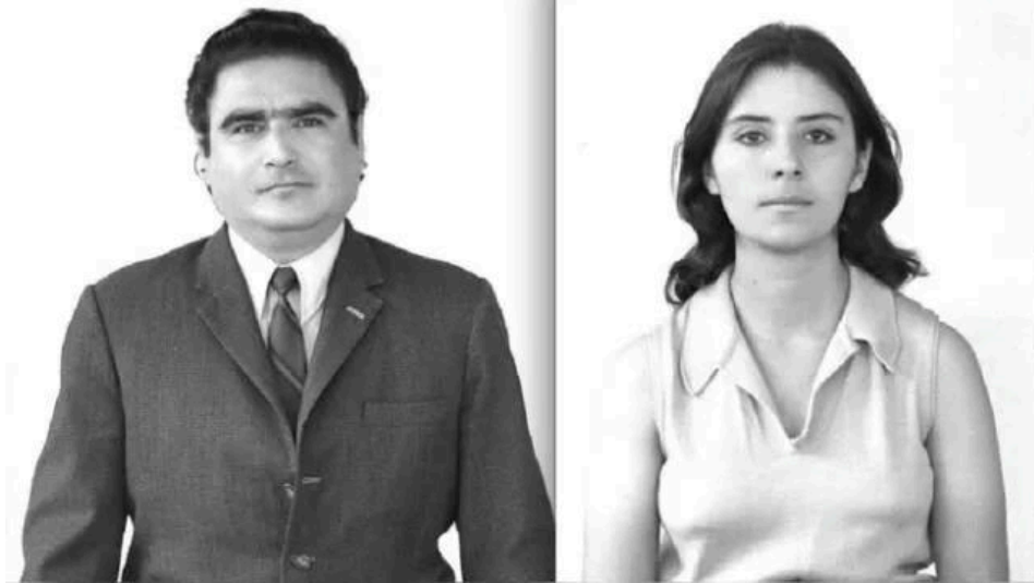
Dr. Abimael Guzmán Reinoso, Chairman Gonzalo, Chairman of the Communist Party of Peru, and Augusta La Torre Carrasco, Comrade Norah. Teacher of Communists, the eagle of the Party. A life totally and completely dedicated to the Party and the Revolution.