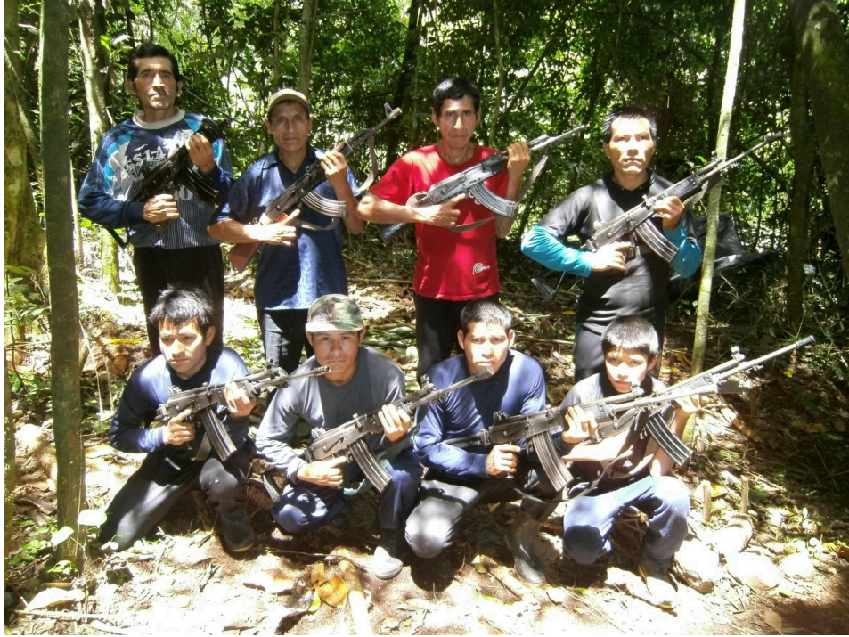
Combatants of the People's Liberation Army in the sector called Churrubamba, Huanta Province–Ayacucho. February 2012.