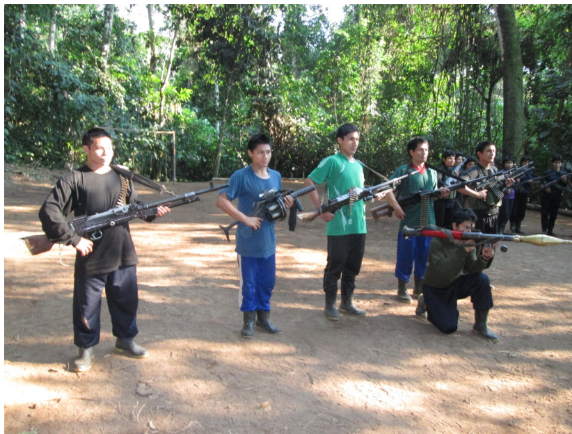
COMBATANTS OF THE PEOPLE’S LIBERATION ARMY. COMMUNIST PARTY OF PERU, MARXIST-LENINIST-MAOIST, GONZALO THOUGHT. PAMPA AURORA SEPTEMBER 2013. TO THE NORTH OF THE PROVINCE OF HUANTA, ZONE OF THE VIZCATAN GUERRERO.

We provide you with some views of the actions of the People’s Liberation Army, as tangible proof of what the People’s War is in Peru. These views are in the documents that we have published and that are fully known to the Armed Forces and the police forces, since they are the ones that have brought the weapons that we have today. Most of the weapons owned by the People’s Liberation Army come from the armed forces and the police forces. We make the other part we confiscate and, by the way, we have not been able to acquire them in the market due to their high cost.