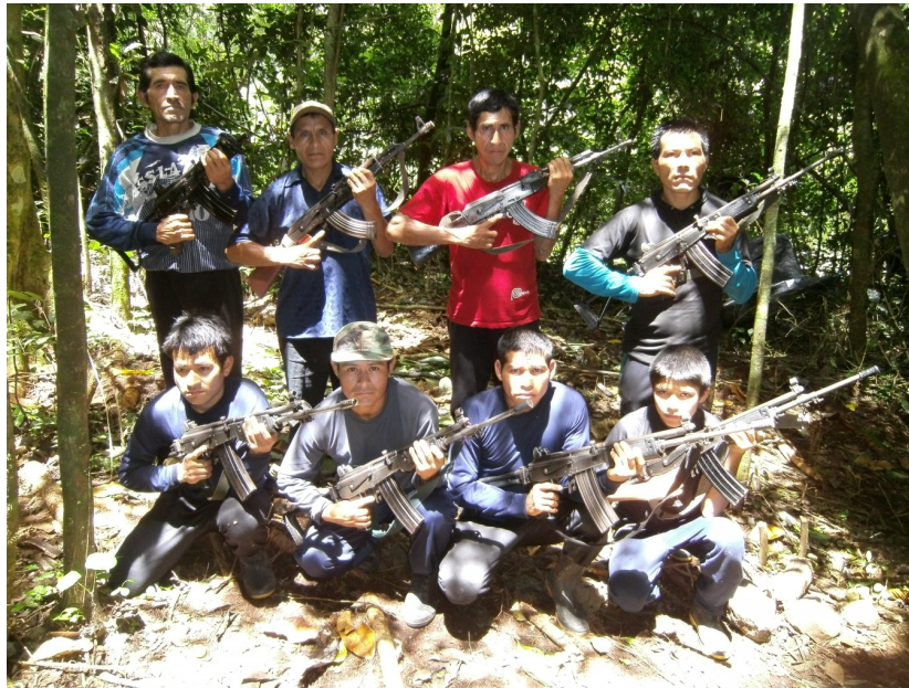
Combatants of the Popular Liberation Army, in the sector called Churrubamba, Huanta-Ayacucho Province. February 2012.