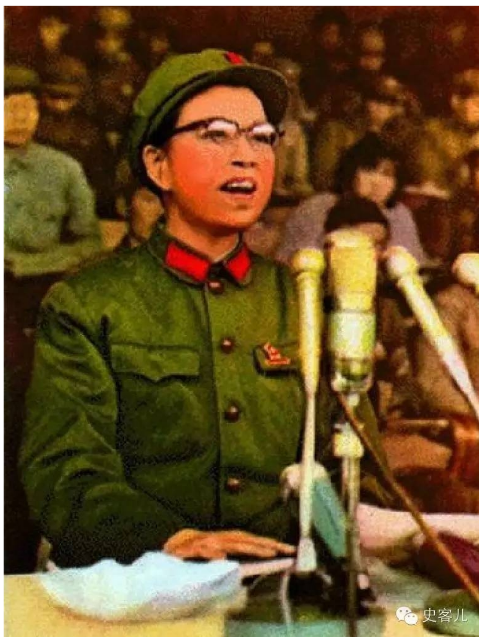
COMRADE JIANG QING, STANDARD OF THE GREAT PROLETARIAN CULTURAL REVOLUTION. COMPANION, COMRADE AND FAITHFUL DISCIPLE OF CHAIRMAN MAO ZEDONG.