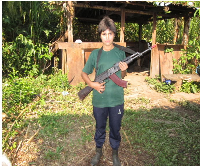
Photo of a combatant

OUR FIERCE DECISION TO FIGHT TO THE LAST DROP OF BLOOD, IN DEFENSE OF THE PARTY AND THE REVOLUTION, UNDER THE UNDEFEATED FLAGS OF MARXISM-LENINISM-MAOISM, GONZALO THOUGHT; ESTABLISHING THE PEOPLE'S REPUBLIC OF PERU: FROM A NEW DEMOCRACY AND WITHOUT ANY INTERMEDIATE BUILDING SOCIALISM, MAINTAINING THE POWER OF THE WORKING CLASS, THROUGH SUCCESSIVE CULTURAL REVOLUTIONS AND TOGETHER WITH THE PEOPLES OF THE WORLD, WILL REACH THE BEAUTIFUL AND LUMINOUS COMMUNISM, THE FINAL GOAL OF HUMANITY.