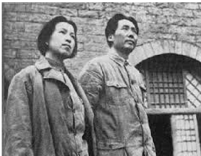
Chairman Mao Zedong and Comrade Jiang Qing, at the Yanan support base.