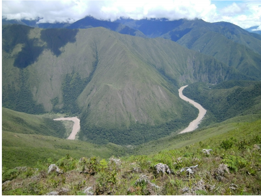
Peru People's Movement (Reorganization Committee) MPP (CR) March 2017