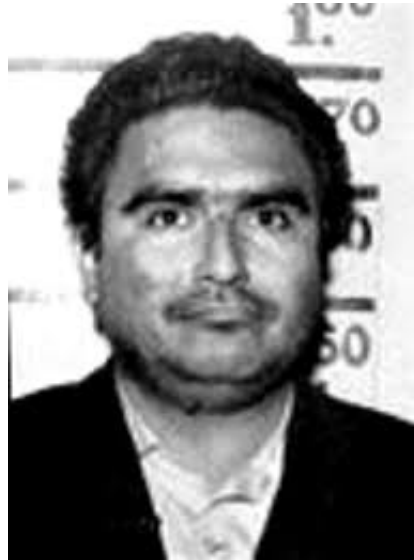
Dr. Abimael Guzmán Reinoso, Chairman Gonzalo. Head of the Communist Party of Peru, Great Marxist-Leninist-Maoist, Gonzalo Thought.

“THE CENTRAL TASK AND THE HIGHEST FORM OF EVERY REVOLUTION IS THE TAKING OF POWER THROUGH ARMED STRUGGLE, THAT IS, THE SOLUTION OF THE PROBLEM THROUGH WAR. THIS REVOLUTIONARY MARXIST-LENINIST-MAOIST PRINCIPLE, GONZALO THOUGHT, HAS UNIVERSAL VALIDITY, BOTH IN PERU AS IN OTHER COUNTRIES”. -Central Committee of the PCP.